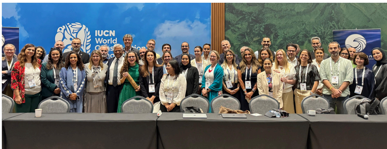
Participants at the From Abu Dhabi to Belém: Mobilising the Ocean Breakthroughs through Ecosystem Connectivity in the MENA Region Deep Dive Session