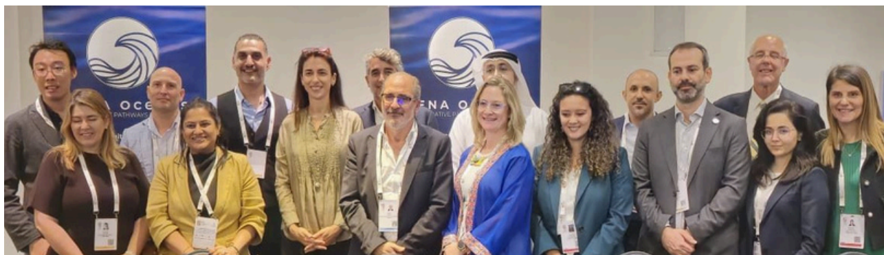
Participants at the MENA Marine Protected Areas Deep Dive Session